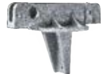
SNH-BRKT-91UF-0L90 SNH-BRKT-91UX-0L90 5-1/2"; 90° FITS ALL U-POST 180° OPTIONS ALSO AVAILABLE