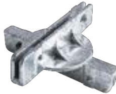
SNH-SEP-990F SNH-SEP-990X 5-1/2"; 90°