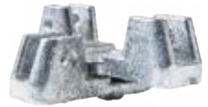
SNH-BRKT-457F SNH-BRKT-457X 3-3/4" MULTI ANGLE 45°, 135°, 180° CAN NOT BE SET AT 90°