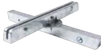
SNH-BRKT-12-90F SNH-BRKT-12-90X 12" 90° CROSS BRACKET