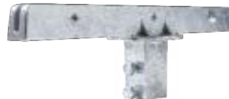
SNH-BRKT-12U-90F SNH-BRKT-12U-90X 12" 90° FITS ALL U-POST 180° OPTIONS ALSO AVAILABLE